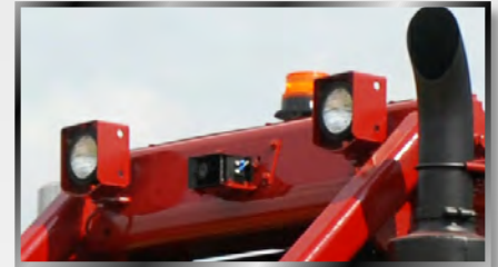
Overhead rear work lights for improved safety and visibility Key-switch actuated amber strobe light Reverse activated alarm