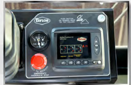
Easy to understand diagnostic display. TICS (Taylor Integrated Control System) using CANbus technology is standard on the TX Series.

The TXi Series features a spacious, all steel cab with increased leg and head room, sound deadening rubber mat flooring, tilt steering wheel, simple T-shaped dash with hinge down instrument panel, fingertip electric joystick controls, and optional climate control system for operator comfort and convenience.