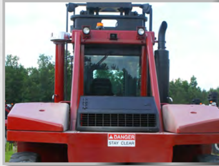
Unobstructed rear view The air snorkel and shielded exhaust are mounted on the corners of the cab to keep the view open.