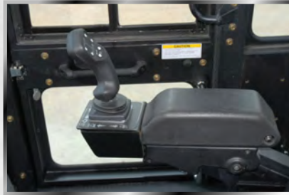
Comfortable adjustable arm rest with fingertip joystick control for smooth precise handling