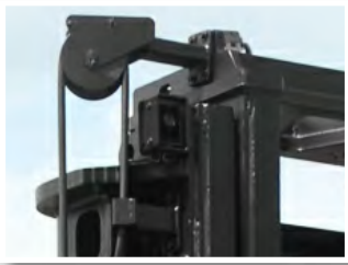
Forward activated alarm