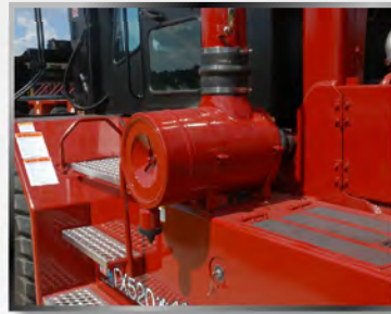
Dual element air cleaner with restriction indicator