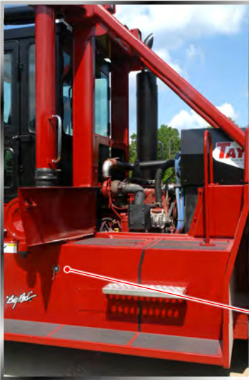
Battery cut-off switch