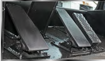
Two brake pedals left – brakes and inching right – brakes only