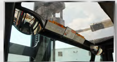
Dual panoramic interior rear view mirrors standard Dual external side view mirrors standard Optional pedestrian camera and monitor

This blend of ergonomics and technology will help your operator be more efficient with the job at hand... handling materials.