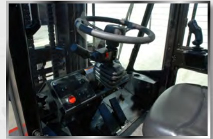
Spacious uncluttered cab with tilt steering, hinge-down dash, climate controls and adjustable seating Premium vinyl or cloth seat that rotates 15° left and 20° right